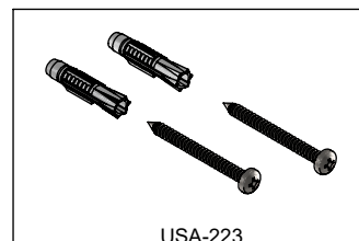
USA-223 Fixing Kit